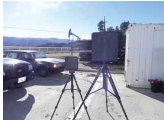
Figure 5.2.2-1 Eagle5-N and Eagle5-NL

The Eagle5-N is a stand-off device intended to be used for surveillance, intrusions and area/perimeter monitoring. The device normally is mounted on a tripod, but it can also be affixed to objects by use of customized fixtures. The Eagle5-N has a range of approximately 12 meters for detecting breathing behind a barrier. 22 It has a 60-degree field of view, although modifications are available to allow