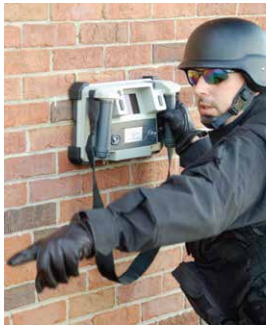
Figure 3.3.2-1 Xaver 400

The Xaver 400 (FCCID: A42X400F) is made by Camero-Tech and distributed in North America by Mistral Security. 13 Compared to the Xaver 100 (see Section 3.3.1), the Xaver 400 is a larger two-handed device that provides additional information, such as approximate direction (azimuth) and tracking, for user interpretation. 14 The Xaver 400 can detect living as well as static objects within a maximum range of 20 meters with a field of view of 120 degrees. The Xaver 400 operates in three modes (Tracker, Expert and High Penetration) and has three maximum detection ranges (4 meters, 8 meters and 20 meters). Because it can