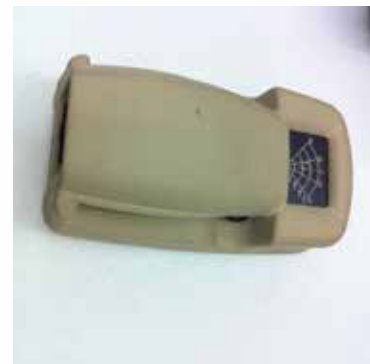
Figure 5.1-1 Raytheon InSight STTW (Demonstration Unit)

The InSight is a handheld TTWS made by Raytheon for military use. 16 This small handheld device weighs 3.3 pounds and can operate for 3.5 hours using rechargeable batteries. The device has a 100-degree, two-dimensional (2D) field of view with an operating range of up to 40 meters. The device is able to detect walls as well as moving targets, including slight motion (although not motion associated with breathing). The InSight operates between 2.9 and 3.5 GHz, and is expected to cost in the $10,000 to $15,000 per unit price range for large orders. 17