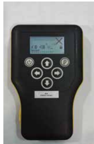
Figure 5.6-1 ACU-CPR4 Photo courtesy of Acustek. Used by permission.

The ACU-CPR4 by Acustek, a single-frequency, continuous wave TTWS device manufactured in Ireland, 34 detects motion by Doppler signature of moving objects. The movement of the chest cavity during breathing provides sufficient motion to detect an individual who is intentionally remaining motionless or is unconscious. The ACU-CPR4 is a recent upgrade of the ACU-CPR3 and detects the direction of motion and estimates range to the moving target through the use of proprietary methods. The ACU-CPR4 detects motion at a range of 25 meters without attenuating barriers and weighs approximately 1.3 pounds with a battery life of up to 10 hours. Several devices (up to seven) can be linked to a single computer by Bluetooth or to Android-based devices. 35