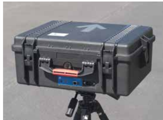
Figure 6.1-1 ASTIR Prototype

The AKELA Standoff Through-wall Imaging Radar (ASTIR) is a portable TTWS device currently being developed by AKELA under NIJ R&D funding. The prototype device is built within a protective carry case for direct deployment on a tripod. It is operated by an external power supply and laptop computer. ASTIR uses a (relatively) large spaced antenna array to gather location data and detect motion. It operates by scanning between 3,101 – 3,499 MHz with a maximum output power of 50 mW (10 dB antenna gain mid band). 40 The ASTIR operating range is 30 meters and it detects moving and stationary objects with enough sensitivity to detect motion associated with breathing. 41 The SSBT CoE is conducting a detailed evaluation of ASTIR in fall/winter 2012.