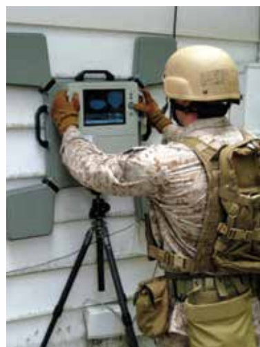
Figure 5.3-1 Xaver 800

The main power source for the Xaver 800 is rechargeable batteries that operate the device for 2 hours. Currently, Camero-Tech has no plans to have the Xaver 800 certified by the FCC. 25