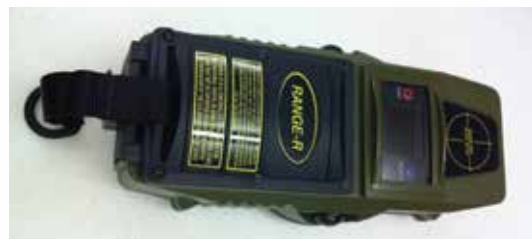
Figure 3.2.1-1 L3 CyTerra Range-R

The Range-R is made by L-3 Communications CyTerra Corporation (FCCID: YKD-25TWD3000). 8 Although the Range-R technically uses CW and scans a wide range of frequencies, it is placed in the pulse-based equipment category because it uses a technology known as Stepped Frequency Continuous Wave (SFCW). In