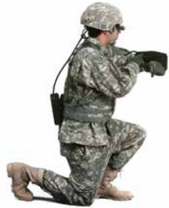
Figure 5.2.1-1 Eagle45-W Photo courtesy of TiaLinx. Used by permission.

The Eagle45-W is a wearable UWB device with the transmitter/receiver worn on the arm, leaving the hands free. The display unit can be a monacle or integrated with glasses or goggles. The Eagle45-W has an unobstructed detection range of approximately 18 meters with a field of view of 120 degrees. 21 The unit is portable, battery operated for up to 4 hours and capable of wireless communications up to 300 feet from the scanner unit. The unit is 7 inches x 6 inches x 5 inches and weighs approximately 5 pounds. (Pricing information withheld at the request of the manufacturer.)