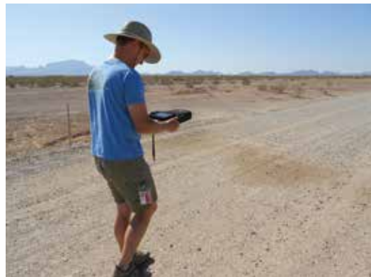
Figure 5.2-1 Eagle5-P Searching for culverts or tunnels

It should be noted that in addition to these stand-alone devices, TiaLinx has incorporated its TTWS technologies into unmanned aerial vehicles (UAV), unmanned ground vehicles (UGV) and a ground-penetrating radar device. The Phoenix 50-H is a UAV and the Cougar Family consists of small robotic UGVs. Both the UAV and the UGV family use UWB pulse technologies for detection of targets. The main advantage is that in hostile environments, the vehicles eliminate the necessity of humans entering and placing equipment in high-profile and/or dangerous situa-