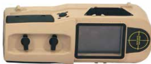
Figure 6.4-1 Range-R 2D

MHz band. However, the Range-R 2D exploits a wider portion of the band than the Range-R. The Range-R 2D has an effective detection range of 20 m, an accuracy of \pm 2 m and a 120^\circ field of view in both azimuth and elevation. It incorporates a rearward-facing antenna and advanced signal processing algorithms to compensate for operator-reflected signals and extraneous false positive signals to the sides of the area of interest. The Range-R 2D displays the active field of view, the initial wall of contact and a second rear wall, and can detect and track multiple targets simultaneously. The device also provides a warning if the radar signal is being blocked on the other side of the barrier (e.g., by a refrigerator or metal cabinet), and a warning if the device is jammed from outside interference. It can be used in a standoff mode by holding it braced on the ground or other solid object (e.g., hood of a car). L-3 anticipates FCC certification by summer 2013, with commercial availability shortly thereafter. On commercial release, the Range-R 2D will sell for $15,000. 48