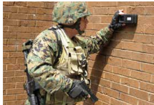
Figure 3.3.1-1 Xaver 100 (Pre-Production Version)

Although UWB techniques use a pulsed system, the emitted pulses differ significantly from those used by the instruments described in the previous section in both pulse width and frequency band used. As mentioned in the introduction, these properties can create advantages over normal pulse systems. UWB instruments create an extremely short (nanosecond) pulse that contains a wide range of wavelengths. The composite pulse enhances the probability that at least a portion of the wavelengths will be able to penetrate obstacles (such as walls) and reflect off the intended targets. The extremely short pulse duration may also allow for higher range resolution.