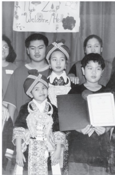
A Cambodian family, in ceremonial attire, graduating from FAST in Wisconsin.