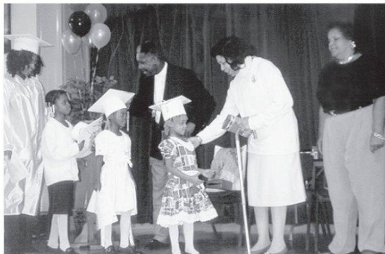
A family graduating from FAST in Washington, DC.

Ninety-one percent of FAST parent graduates report an increased involvement in community activities, even though one-third of this sample never attended FASTWORKS. Parent activities 2–4 years after the FAST program include pursuing further education for themselves (44 percent), attending church (35 percent), and obtaining employment (55 percent). Some parents reported greater involvement in more than one activity. After participating in FAST, most families no longer feel socially isolated and both youth and parents report the availability of stronger formal and infor-