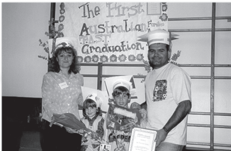
A family graduating from the first FAST implementation in Australia.