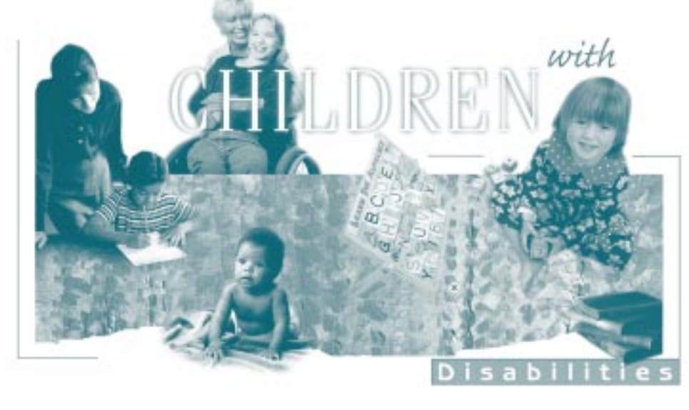
Visit the Web site at: www.childrenwithdisabilities.ncjrs.org.