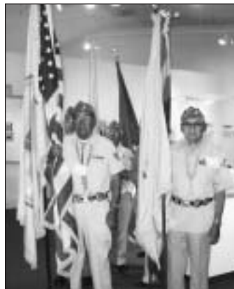
Navajo Code Talkers led the opening flag ceremony at the July 2003 conference, "Holding Up Both Ends of the Sky: Juvenile Justice Partners in Indian Country."

As part of its T&TA activities, OJJDP sponsored a day-long conference for tribal leaders in Window Rock, AZ, the government seat of the Navajo Nation, on July 1, 2003. More than 170 tribal leaders and community members, juvenile justice officials and practitioners, and others concerned with the well-being of tribal youth attended the conference. The theme was "Holding Up Both Ends of the Sky: