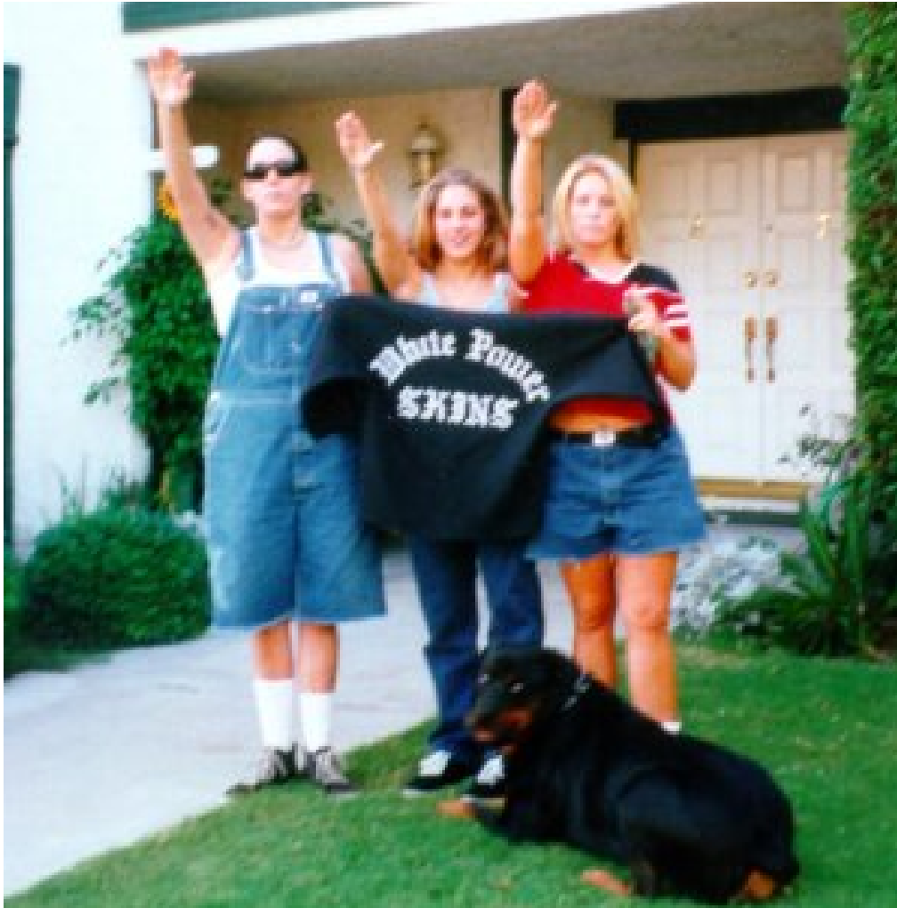
Female Racist Skinheads

gang and how it is known—not just that the member belongs to a gang but how that fact was established (self-admission, tattoos, clothing, or involvement with other self-admitted members in gang-related activity). Whatever the basis, it needs to be documented. Any self-admission should be in quotes: “I claim West Trece,” or “I was jumped into the Orphans,” or “I kick it with Asian Boyz.”