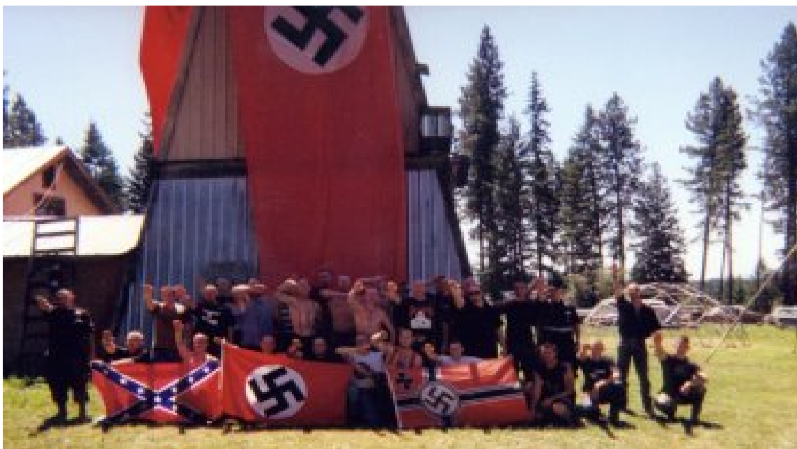
A Gathering of White-Supremacist Skinhead Gang Members

To justify an investigative stop or detention, the circumstances known or apparent to the officer must include specific and articulable facts causing the officer to suspect that (1) some activity relating to a crime has taken place or is occurring or about to occur and (2) the person the officer intends to stop or detain is involved in that activity, Terry v. Ohio , 392 U.S. 1, 21, supra . Further, evidence obtained during an illegal detention or arrest and evidence that is derived from initially illegally obtained evidence may be suppressed, Wong Sun v. United States , 371 U.S. 471 (1963). Derivative evidence, such as a photo identification of a suspect obtained from the use of evidence that was illegally obtained by the police explicitly for use in further criminal investigations (e.g., photos for gang books or field interview cards for gang databases), may be suppressed in court.