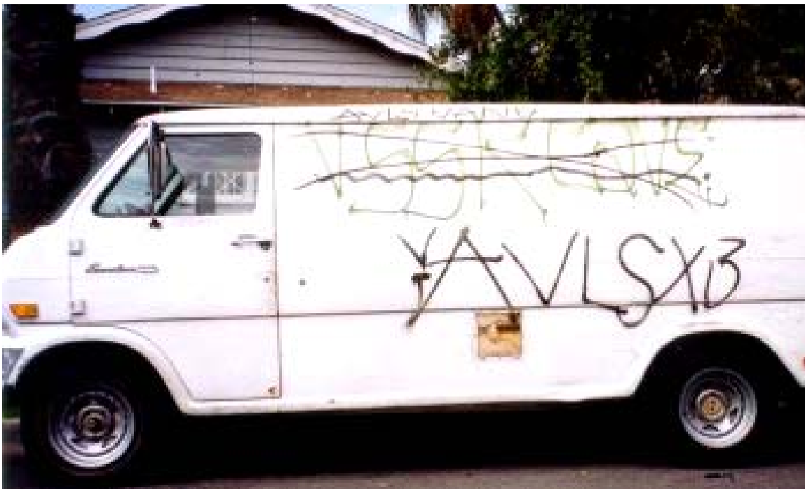
Hispanic Gang Graffiti on a Resident's Van