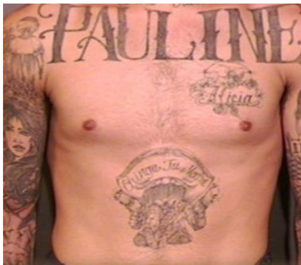
Hispanic Gang Tattoos

For a number of reasons, it is important to analyze and catalog the items seized in a “gang warrant” following the service of the warrant. First, it allows the magistrate who approved the warrant to determine that only items authorized in the warrant were seized. Second, although it is a tedious task, all of the seized letters need to be read, seized film developed, and seized tapes listened to, because their value depends on their content. Finally, a detailed inventory itemizing the evidence should be prepared for use in the instant case and for future use. Such an inventory allows for easy retrieval and should also be included in the gang intelligence files.