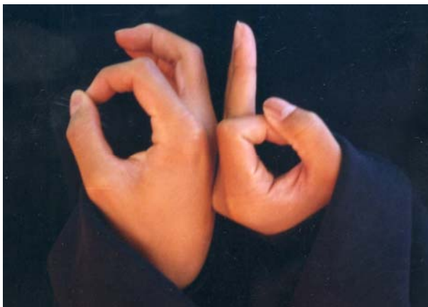
Asian Boyz (Asian Gang) Hand Sign

This documentation should also include examples of personal items, such as letters to and from various members in correctional facilities; other letters with gang reference; schoolwork; and phone books with reference to individual members’ names, monikers, and phone numbers. It is also important to document and catalog any and all examples of disrespect to rival gangs, newspaper articles of gang homicides or other felonious assaults, photos of crossed-out graffiti in public places, and personal items with negative references to rivals with names crossed out. All of these aforementioned items should be properly cataloged by gang name, with the date and time they were discovered, the locations where collected, and the names of the individuals, officers, deputies, or agents who collected the cataloged items.