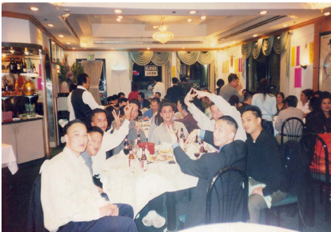
V-Boys (Asian Gang) Dressed Up for Party Flashing Hand Signs