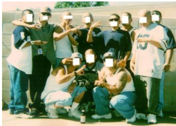
Juvenile Hispanic Gang Members

Under the guidelines in 28 CFR Part 23, Section (b)(6), information in an intelligence database must be evaluated for its relevance and importance at least every five years. Information not in compliance with the submission requirements should be purged, even if it is discovered to be noncompliant before five years. No information from the database should be disseminated without a legitimate law enforcement reason, such as a criminal case being filed against a suspect with information in the database.