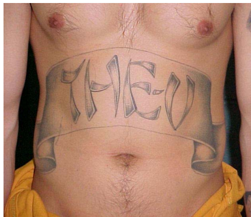
The V-Boys (Asian Gang) Tattoo