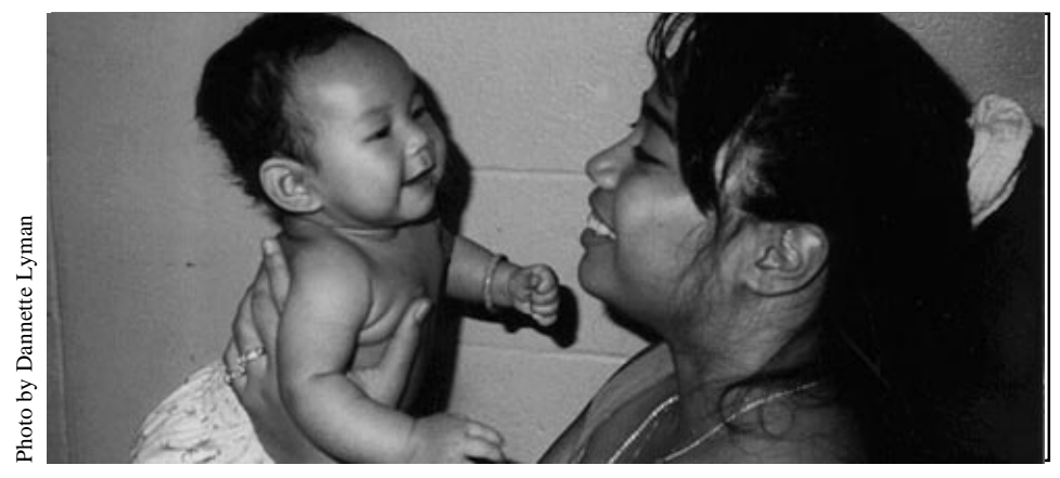
Bonding and attachment in infancy are crucial for the child to trust others as an adult.

Healthy Start mothers complete a series of Infant/Child Monitoring Questionnaires, designed to identify problems in child development at 4, 8, 12, 16, 20, 24, 30, 36, and 48 months. If necessary, the home visitor reads the questions to the mother.