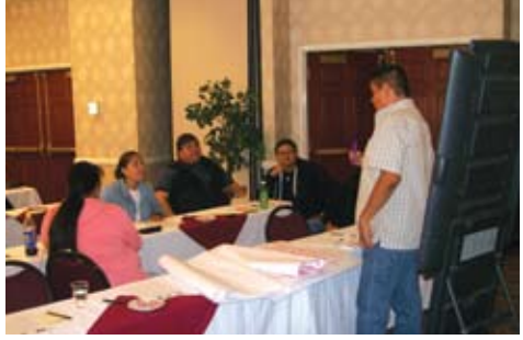
Breakout groups set Indian Country AMBER Alert plans in action

"If your tribal AMBER Alert criteria is different than the state criteria, you