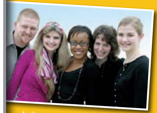
Authors of "You're Not Alone: The Journey From Abduction to Empowerment"

The final seven pages of the 70-page booklet are blank. Those empty pages are left for the next survivor to tell his or her story.