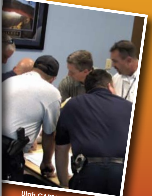
Utah CART in action September 13, 2008