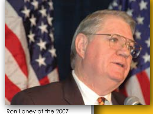
National AMBER Alert Conference

is also looking forward to learning more about new technology, the updated Emergency Alert System and strides to bring AMBER Alerts into Indian Country.